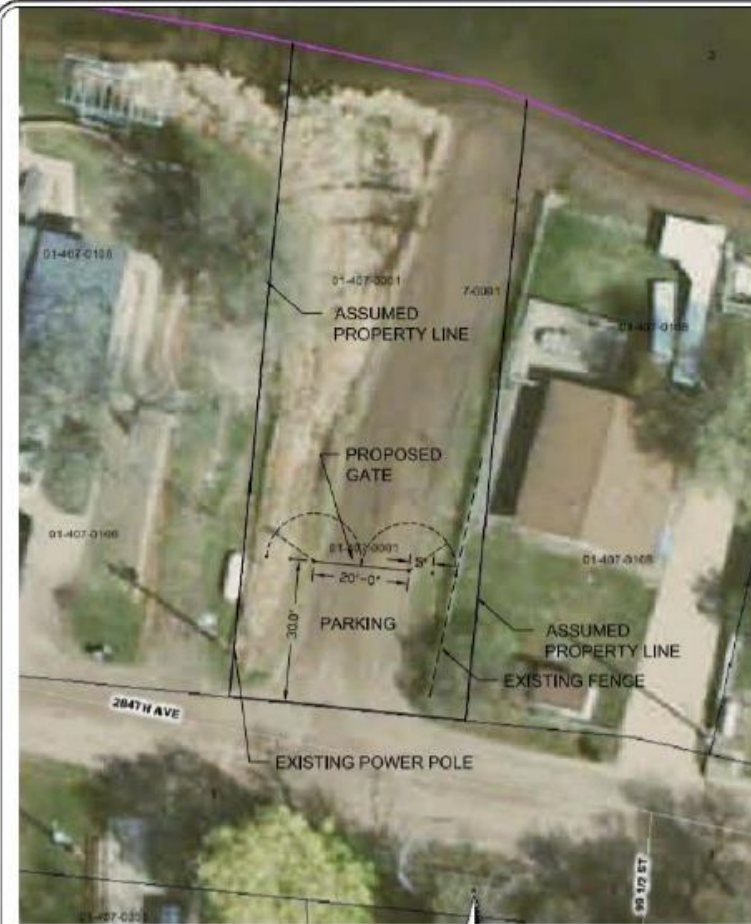
1 PLAN VIEW OF SOUTH LAKE ACCESS